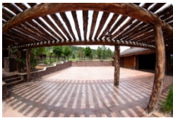
Courtyard, up to Banquet 180