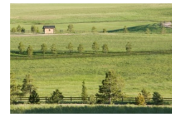
Mountain Meadow, open space