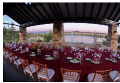
Lakeview Terrace, up to Reception 50